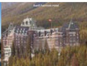
Banff Fairmont Hotel